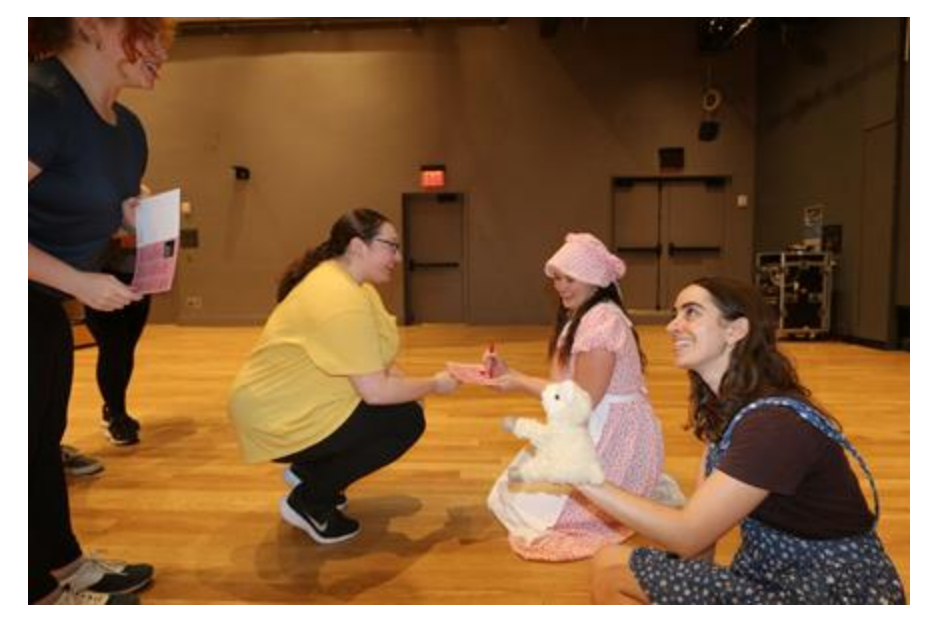
If I want, I can wait quietly in line to get autographs from the cast after the show.