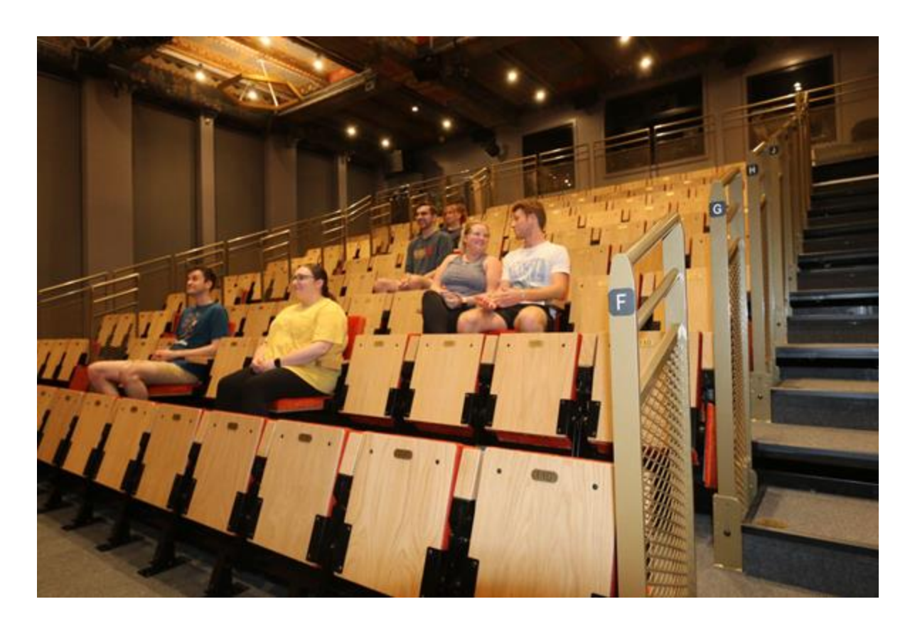
Inside the theater, I can walk around to find my assigned seat.