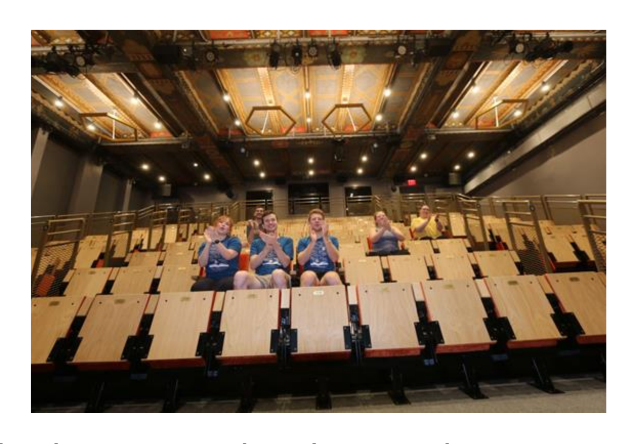
I know the show is over when the actors bow. Everyone will clap and cheer.