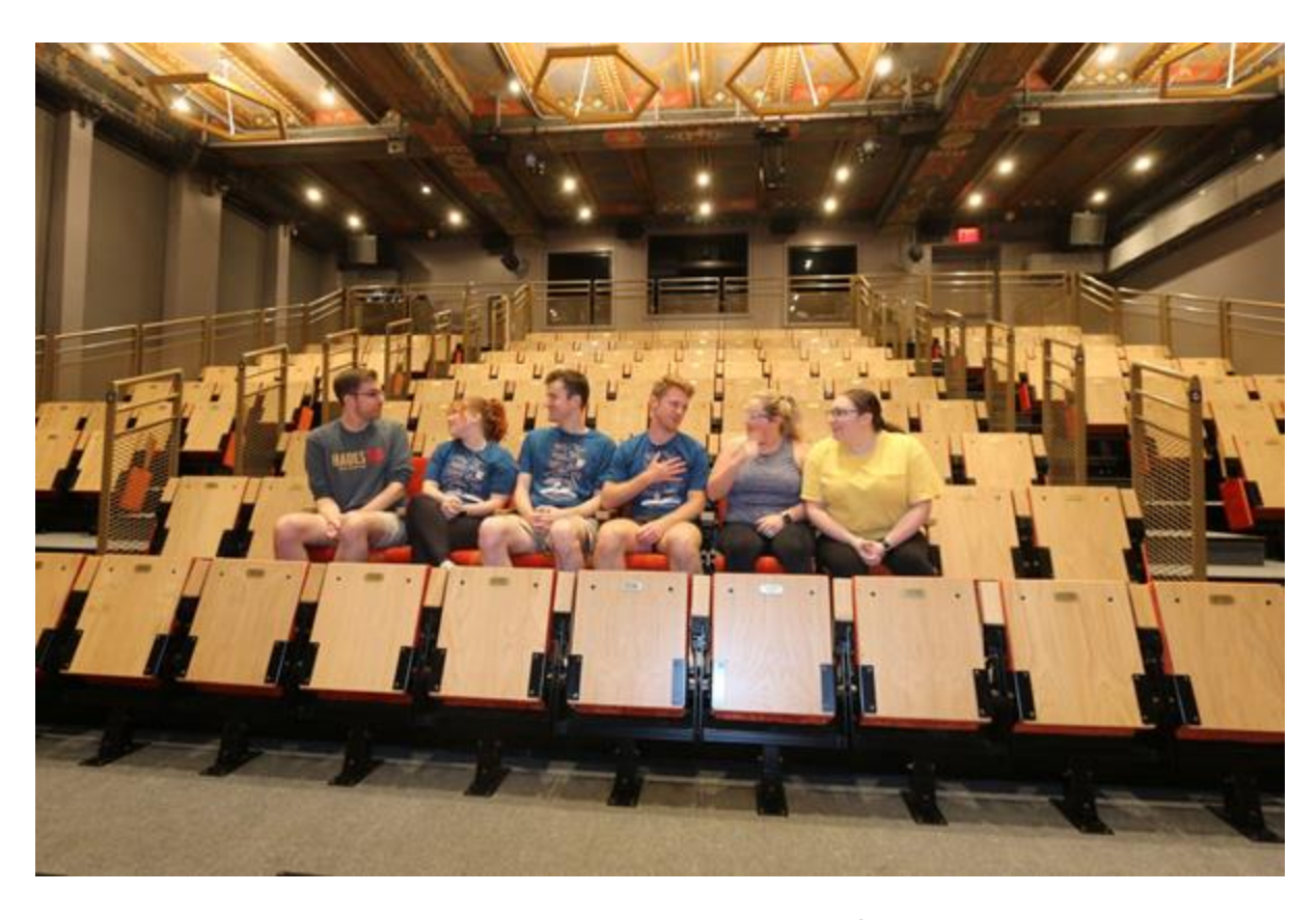
During the show, I will sit with my family. There may be people I don't know sitting close to me.