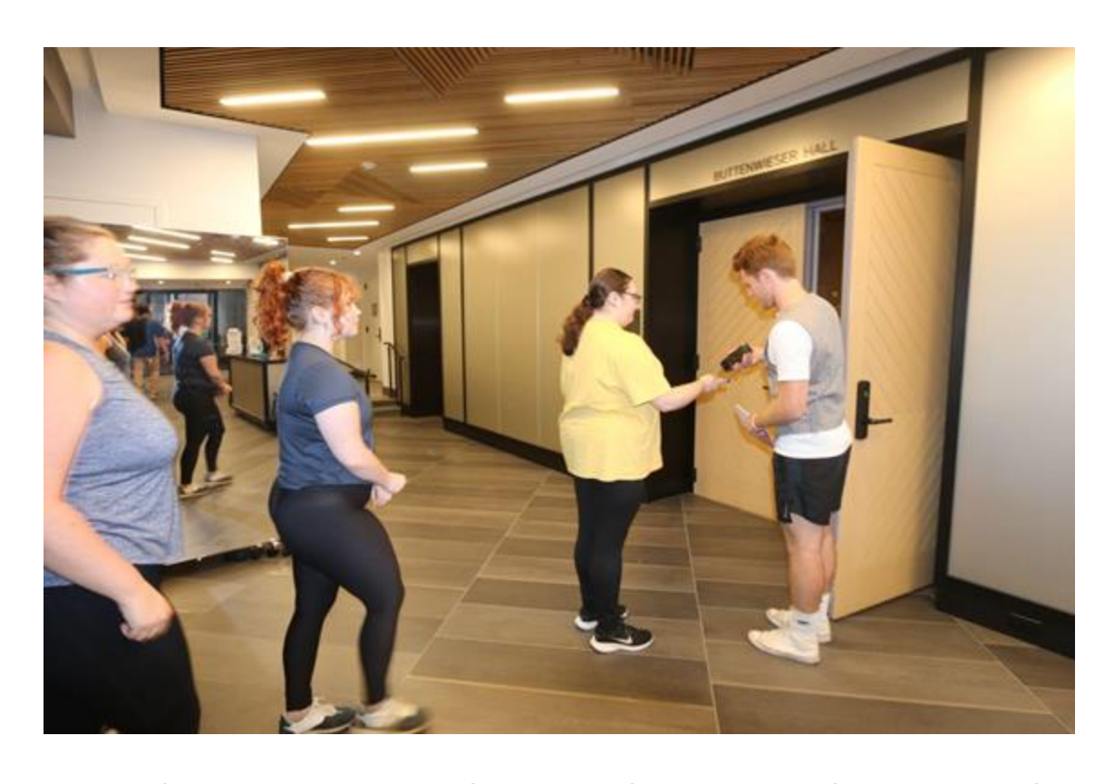
I may have to wait in line to show an usher my ticket. An usher will scan my ticket as I enter the theater. The scanner may beep.