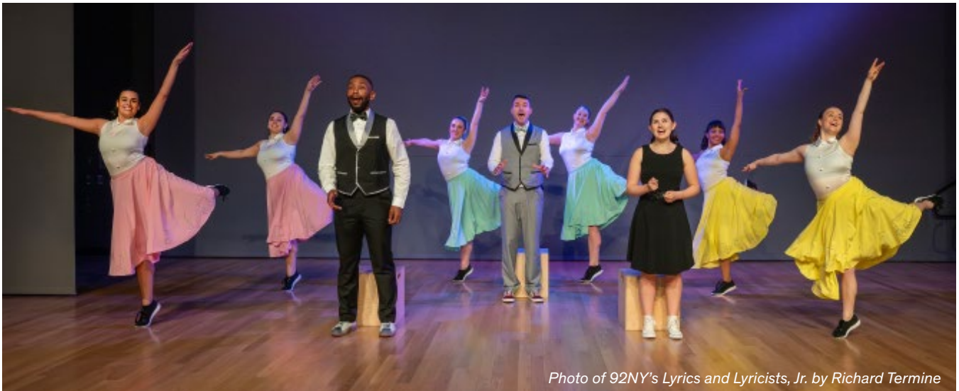
Photo of 92NY's Lyrics and Lyricists, Jr.